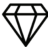
VISA Benefits (EU)