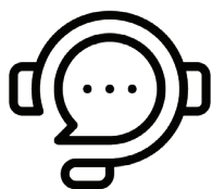
24/7 lifestyle manager