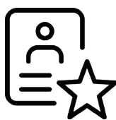
Priority Pass membership